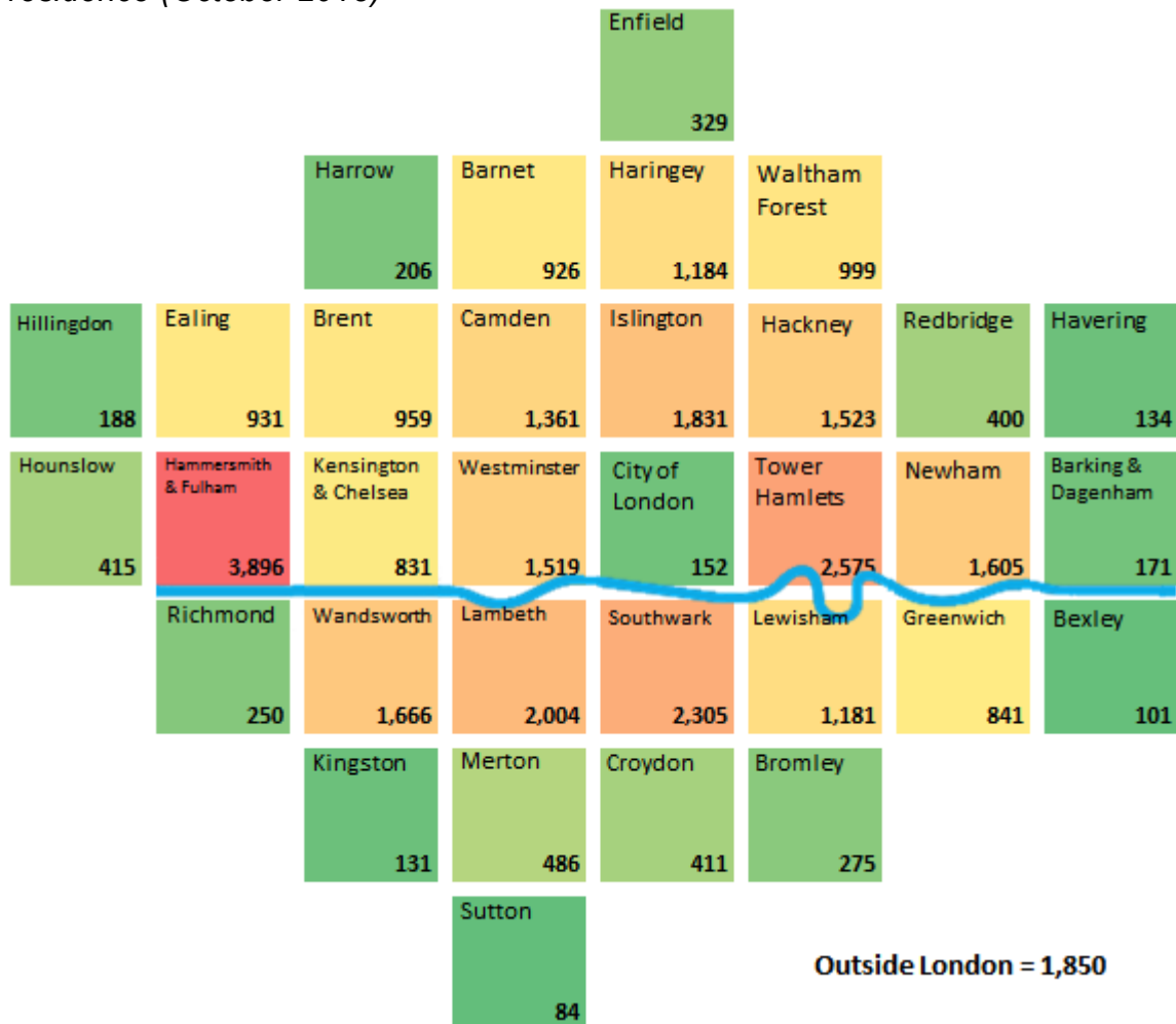
Figure 5: Patients registered at Lillie Road Health Centre by local authority of residence (October 2018)